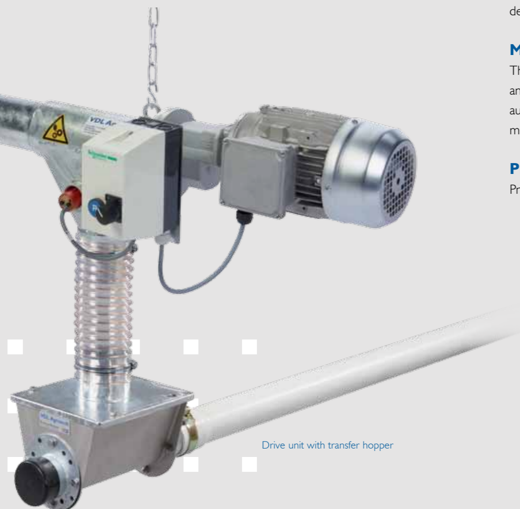
Drive unit with transfer hopper