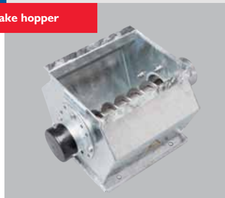
Extension intake hopper