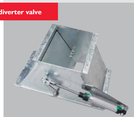
Y-piece with diverter valve